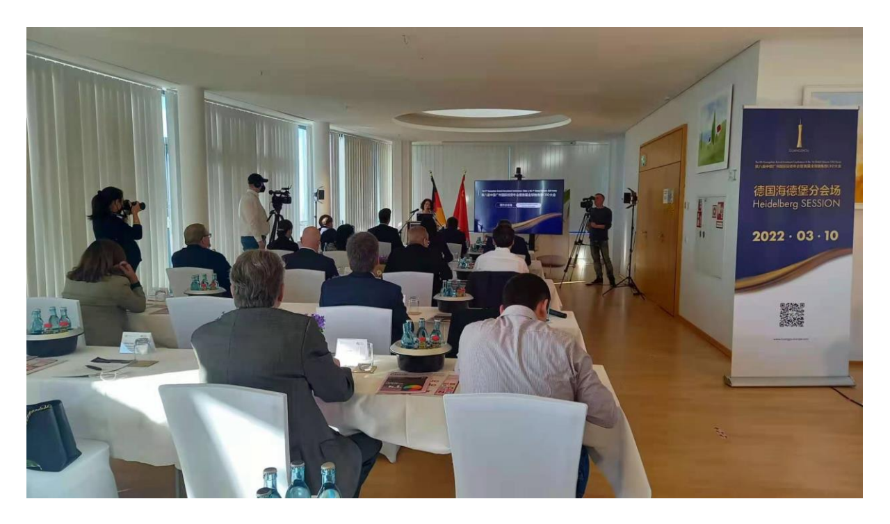
The 8th of GAIC held on the 17th floor, TechTower, Sino German Hi Tech Park

Huangpu (Guangzhou) Europe office and Sino German Hi-Tech Park holds the GAIC session together for the second time since the office launched its operations in March 2020.